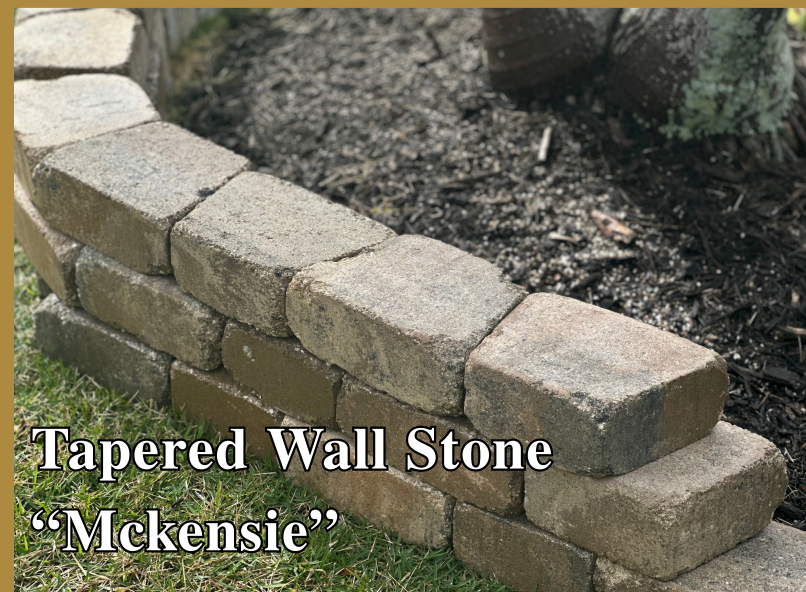
Tapered Wall Stone “Mckensie”