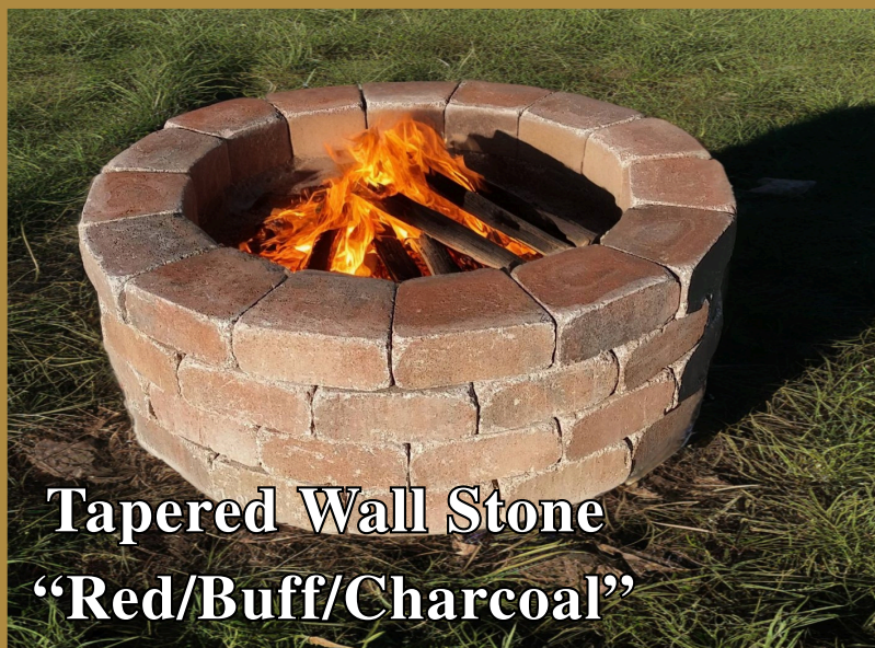
Tapered Wall Stone “Red/Buf/Charcoal”