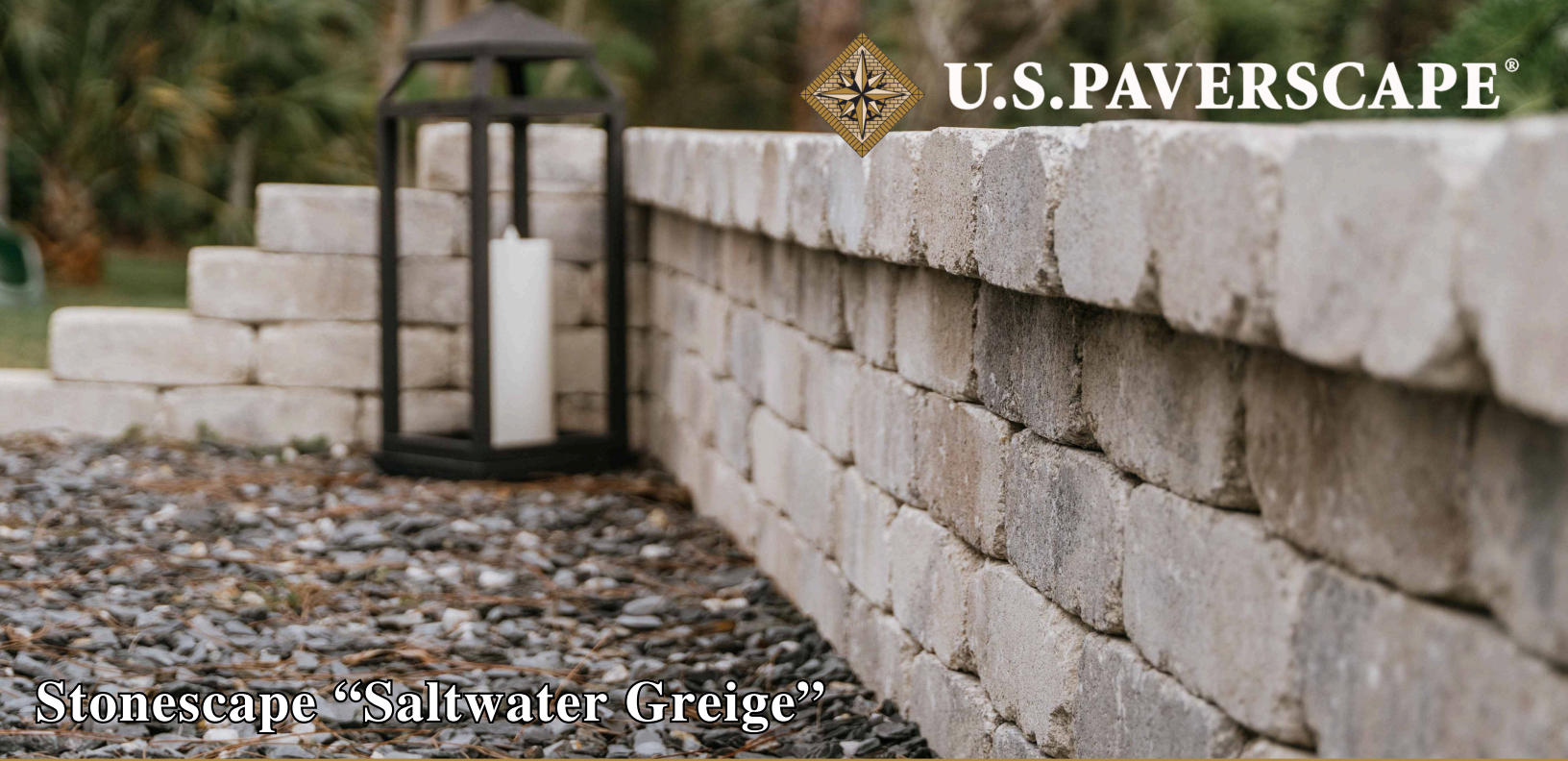
Stonescape “Saltwater Greige”