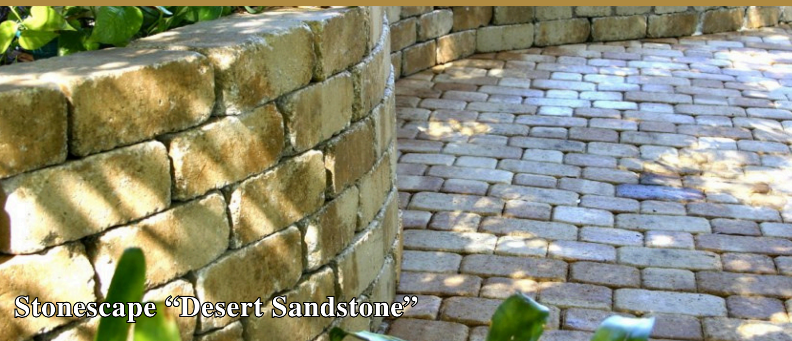
Stonescape “Desert Sandstone”