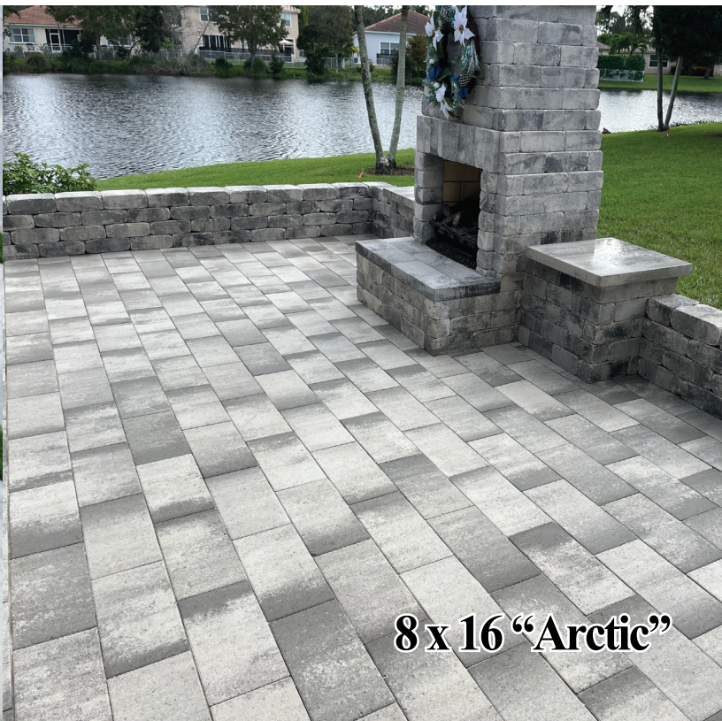
8 x 16 “Arctic”