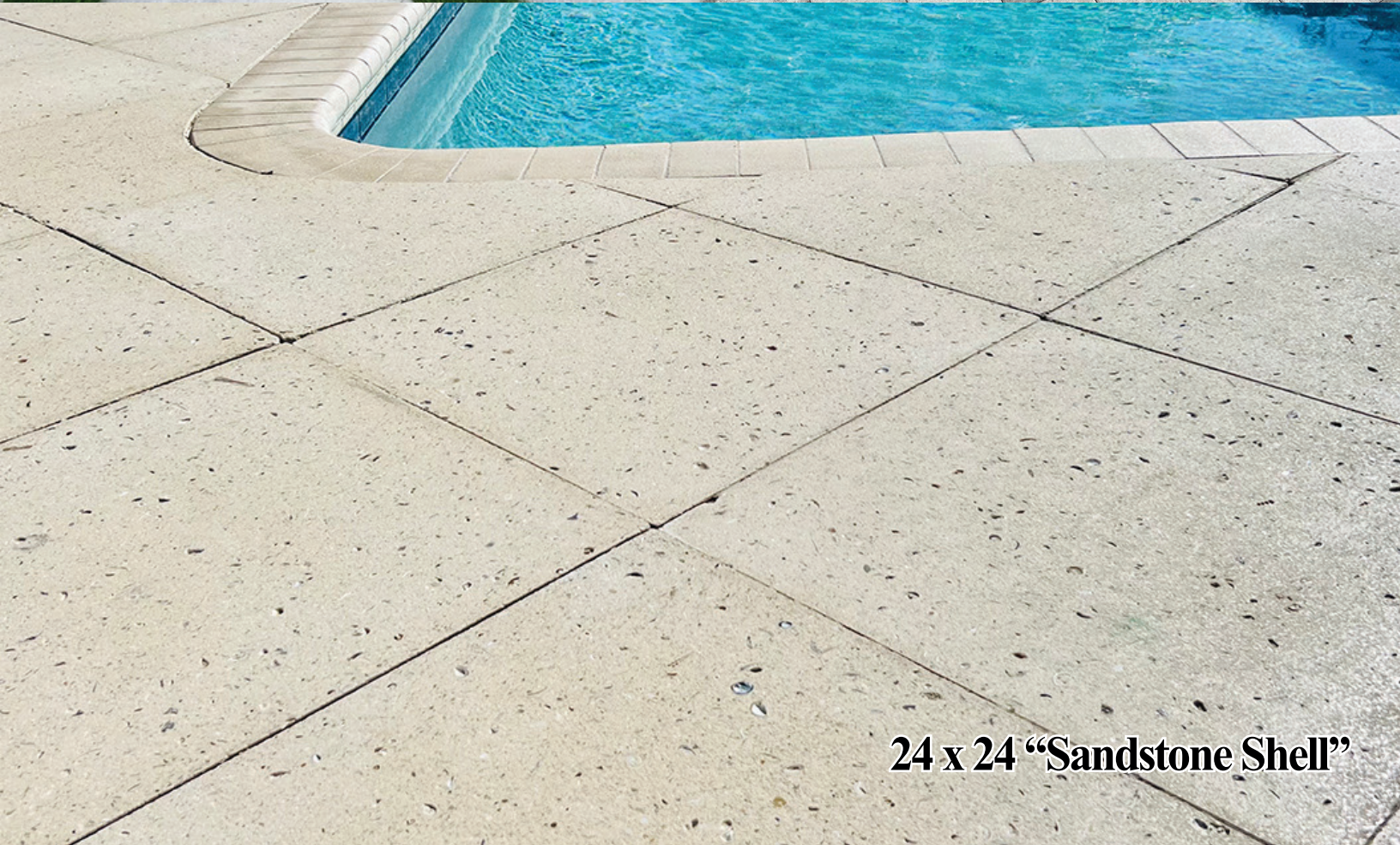
24 x 24 “Sandstone Shell”