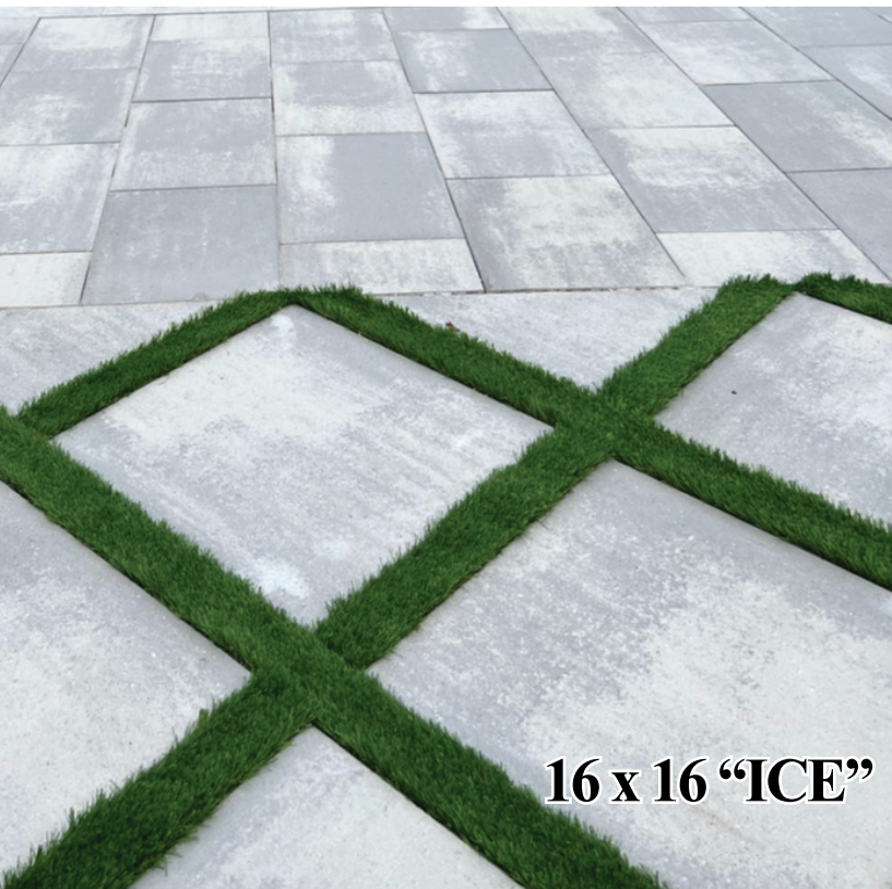
16 x 16 “ICE”